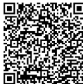
Group Join QR Code

We aim to send all PLR digital communications through our Northamptonshire Talking platform. It is essential all PLRs register on the platform using their council email address so that you can be added to the PLR group. The system uses location based messaging, therefore all communications you receive will be relevant to your area and your council.